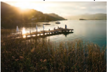
VIVAMAYR, Maria Wörth, Austria

The Capra is a five-star alpine wellness lodge in the car-free Swiss village of Saas-Fee, Switzerland, featuring 38 chalet-style suites blending alpine elegance with modern comfort. Maintaining their two Michelin Guide Keys in 2025, The Capra is proud to be a year-round retreat for seclusion, wellness, and, in winter, exceptional snow.