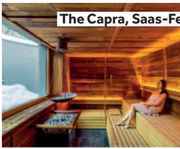
The Capra, Saas-Fee, Switzerland